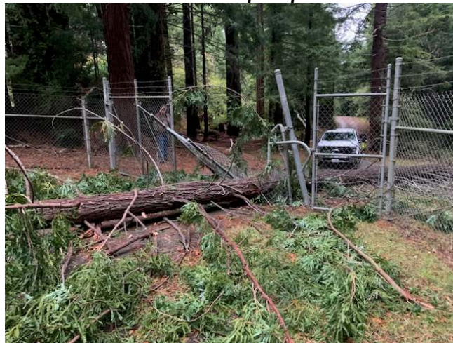
Figure 2: This figure shows the damage to the surrounding fence line from the fallen tree