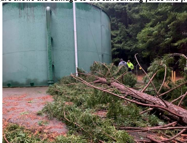
Figure 3: This figure details the extent of the tree fall from the fence line to the tank