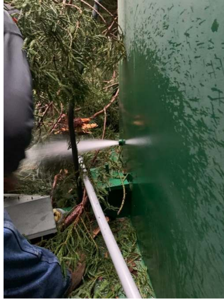
Figure 1: This figure shows the tank leaking with the disconnected auxiliary water line lying to the side of the tank as result of the fallen tree